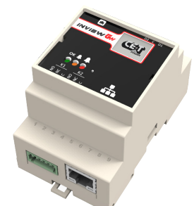
Inview GW DIN

This version is compatible with the 10 and 25 series of our Bravo and Sierra power converters.